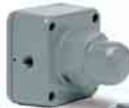
Optional Air Operated Valve (AOV)