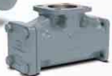
Optional T-style Strainer